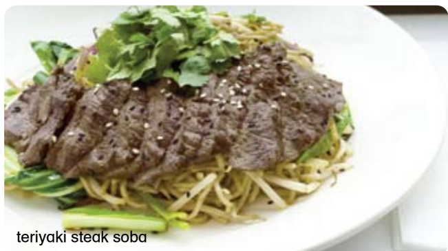
teriyaki steak soba

47 teriyaki chicken €11.90 tender chicken and red onion stir fried in a teriyaki sauce served with japanese-style rice garnished with mixed leaves, sesame seeds and red pickles