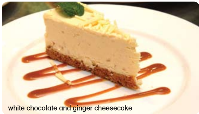
white chocolate and ginger cheesecake