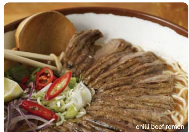
chilli beef ramen