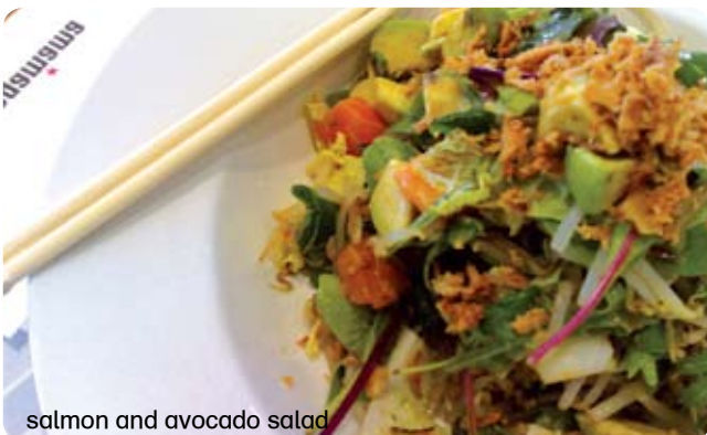
salmon and avocado salad