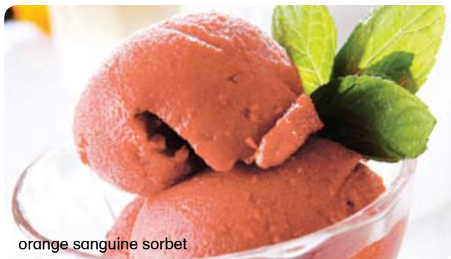
orange sanguine sorbet