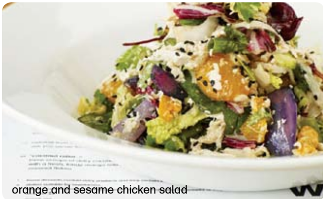
orange and sesame chicken salad