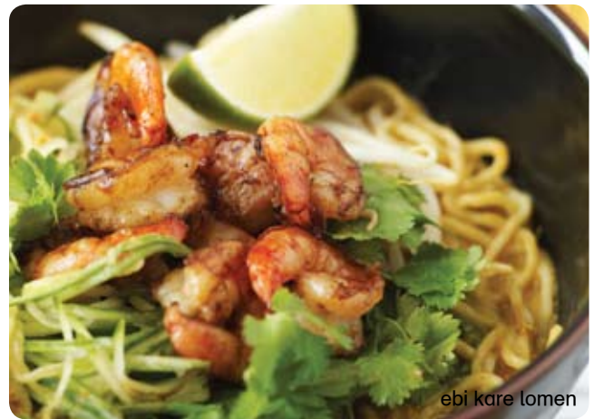
ebi kare lomen