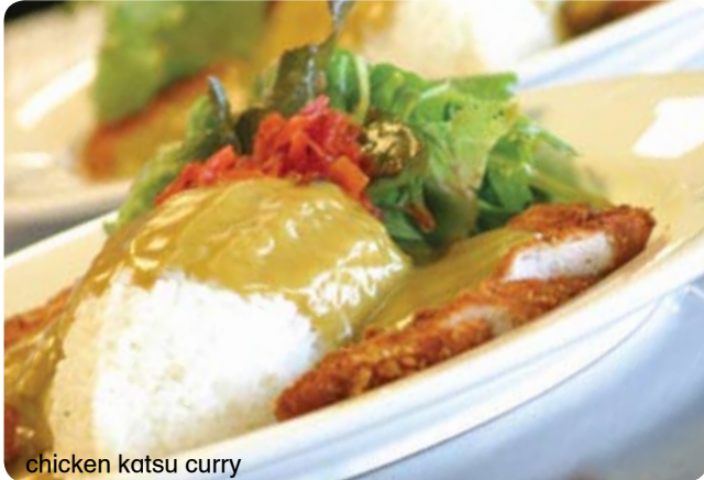
chicken katsu curry