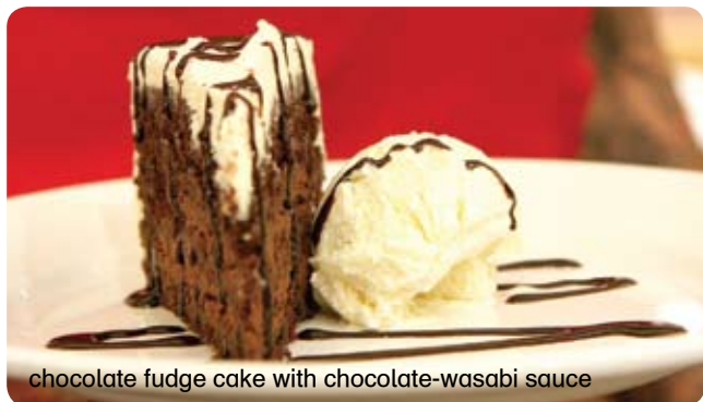
chocolate fudge cake with chocolate-wasabi sauce