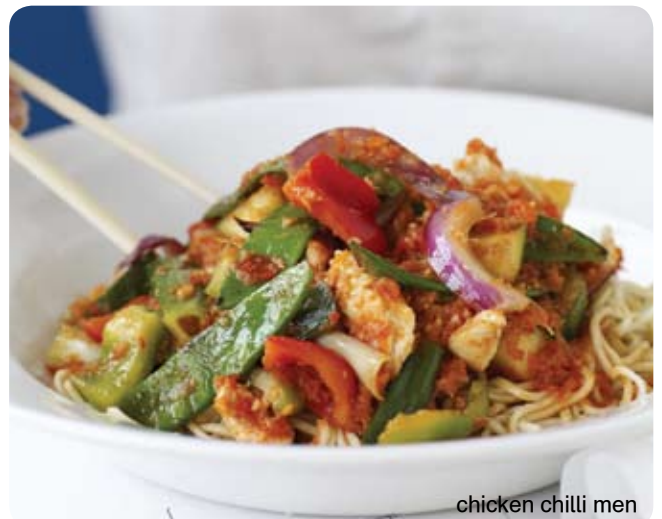
chicken chilli men