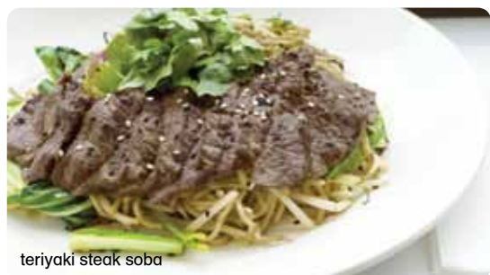
teriyaki steak soba