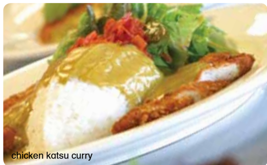
chicken katsu curry