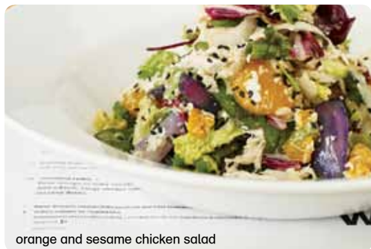
orange and sesame chicken salad