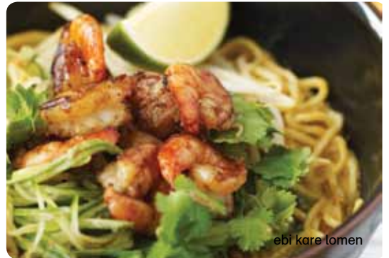
ebi kare lomen

ramen noodles garnished with marinated grilled black tiger prawns, beansprouts, cucumber, fresh coriander and a wedge of lime in a spicy sauce made from lemongrass, coconut milk, shrimp paste, red chillies, fresh ginger and galangal