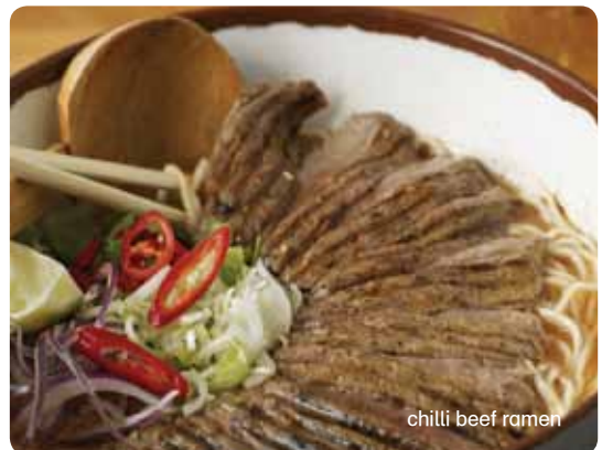
chilli beef ramen

all ramen can be served with vegetarian soup as an option. please ask your serve