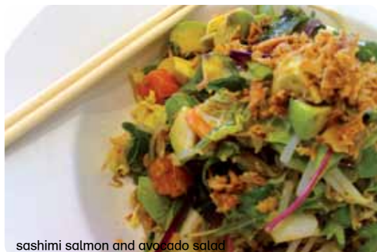
sashimi salmon and avocado salad