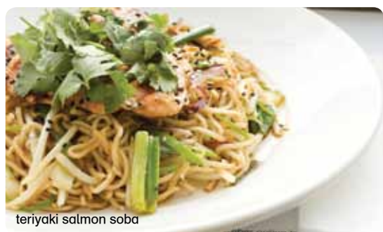
teriyaki salmon soba